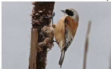
Penduline Tit, Weston Airfield, 3 February 2022.

Penduline tits form the Remizidae, a separate, but closely related, family to the true tits (Paridae), with several species in Africa and Asia and one, the Verdin, in North America. Like the true tits they are largely insectivorous and feed in a similar fashion, busily searching vegetation for their prey, often hanging upside down. Many of the tropical species frequent woodland and scrub, and Verdin is a bird of semi-deserts and arid scrub. Probably the most characteristic feature of the family is their nests, which are beautifully constructed hanging baskets, woven from grasses and suspended from slender twigs. The nests of the European species are impressive enough but do not rival those of some African species, which incorporate a conspicuous tunnel leading to a false chamber whilst the true nest chamber is reached through a concealed entrance with two flaps, which the adults seal shut with spider silk every time they leave. It is amazing that a group of animals whose forelimbs are dedicated to flight are able to perform such feats of engineering.