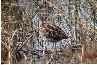
Snipe at Portbury Wharf

I'm sure that many of you will be familiar with Portbury Wharf Nature Reserve. Opened in 2010 to protect a small, but valuable stretch of Severn Estuary coastline, this reserve has had more than its fair share of difficulties in its short life. This talk will look at the reserve's origins, its habitats and wildlife and finish with an analysis of the threats to its future.