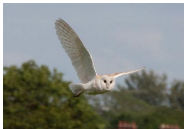
Portbury Wharf images (see p18): Left, Barn Owl Right, Red-Veined Darter