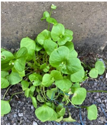
Plate 2. Springbeauty Claytonia perfoliata , Montpellier, Bristol, ST5974, 29 January 2022 © David Hawkins.